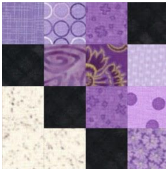
Oct Make 2- 12 ½ x 6